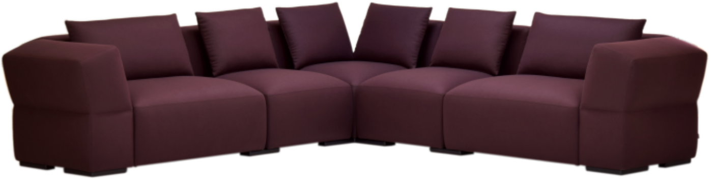
Break K138-I72-K108-I72-L138 + 1 extra back cushion